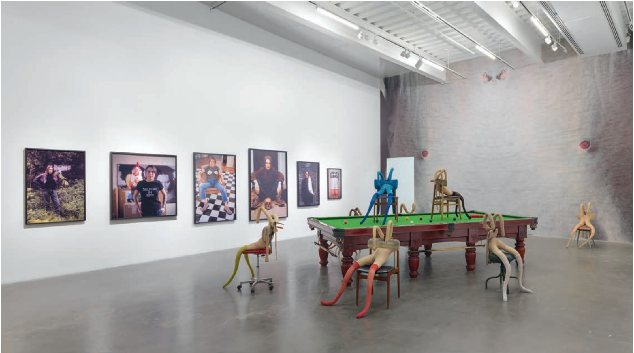
SARAH LUCAS, BUNNY GETS SNOOKERED #3 , 1997 INSTALLATION VIEW, NEW MUSEUM, NEW YORK, 2018