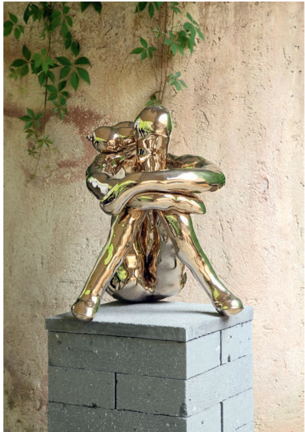
SARAH LUCAS, THE LAW , 2000