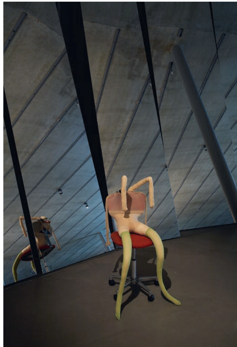
SARAH LUCAS, BUNNY GETS SNOOKERED #3 , 1997 INSTALLATION VIEW, KUNSTHAUS GRAZ, GRAZ, 2008